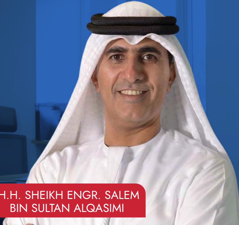
H.H. SHEIKH ENGR. SALEM BIN SULTAN ALQASIMI

INSPIRING AND EMPOWERING THE LEADERS OF TOMORROW